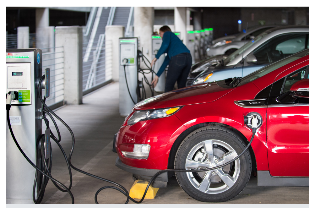
Public charging stations typically have one or more "Level 2" charging units.

A federal tax credit of $2,500-$7,500 is available for PHEV and EV purchases. Depending on your location, you may also be eligible for incentives from your state, city, or utility. Find relevant incentives by searching the AFDC's Federal and State Laws & Incentives database (afdc.energy.gov/afdc/laws).