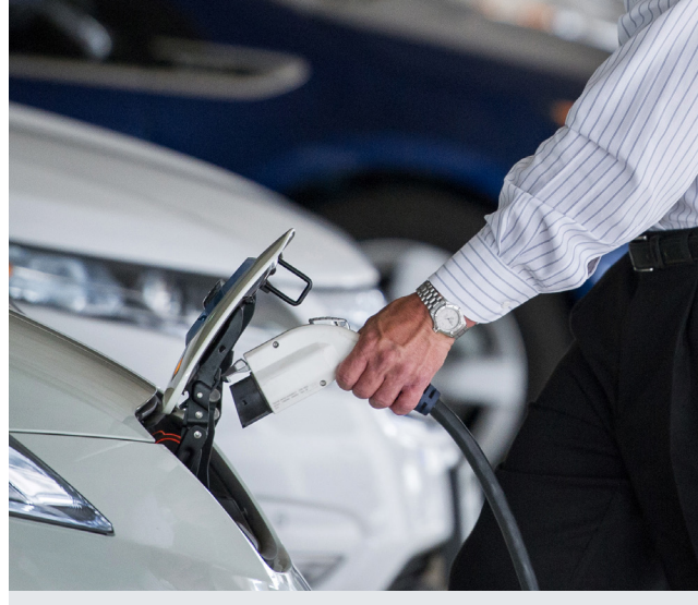
Electric-drive vehicles can offer several benefits, including improved fuel economy, lower fuel costs, and reduced emissions.