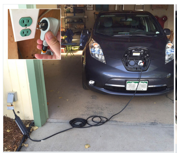
A "Level 1" cordset can be plugged in to a typical dedicated, 110-volt household outlet. Photos by Erik Nelsen, NREL 34794 (left) and 37587 (inset)